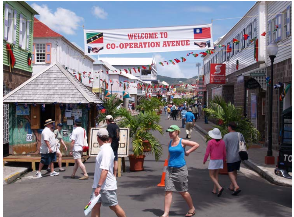
This marvellous pedestrian thoroughfare is actually in Basseterre. It is the ever busy Fort Street transformed to welcome the world.

Campaign for the Cricket World Cup started in Jamaica on Tuesday March 13 with hosts West Indies taking on Pakistan, while action in St. Kitts bowled off the following day, Wednesday March 14 with Australia taking on Scotland. To underscore the importance of this event, Wednesday March 14 was